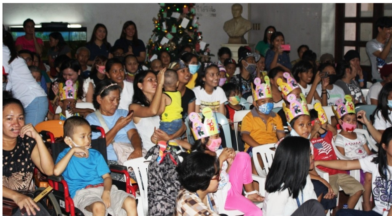
Cancer Institute pediatric patients enjoying the program & gift giving