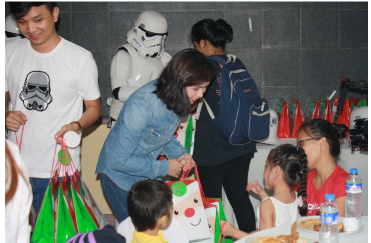
Globe Ambassadors at the Cancer Institute Auditorium distributing for the pediatric cancer patients

Adult patients at PGH wards 1 and 3 were not left out when one hundred thirty (130) boxes of Enervon Prime were distributed to them 8 December 2016 from Unilab Corporation. The PGHMF staff took time to mobilize the gift giving to these patients.