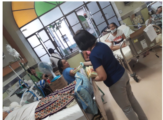
Distribution of Enervon Prime at Ward 1