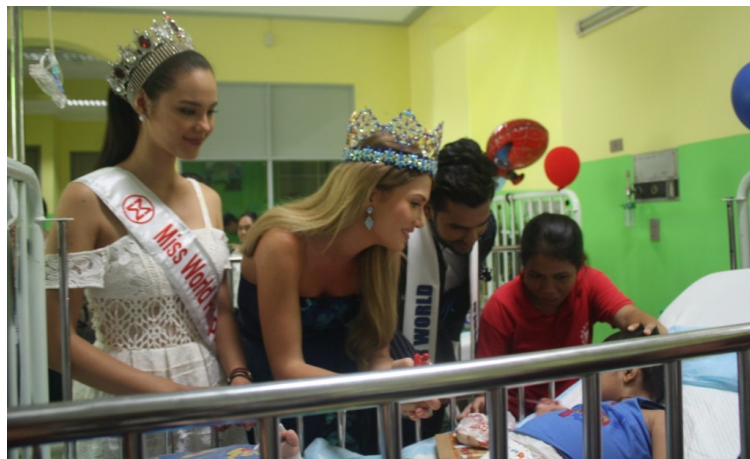
Miss World candidates extending their sympathy & love to a cancer patients