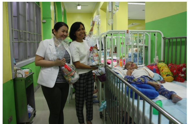
Samsung representative being assisted by a Resident Physician at pediatric ward