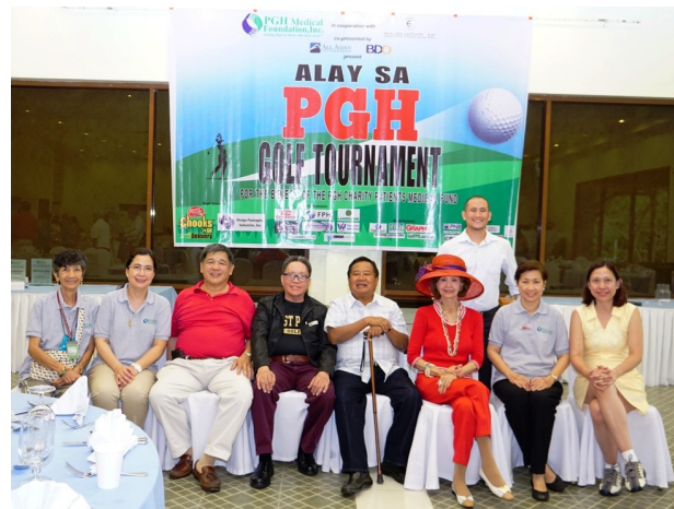
PGH MFI officers posed with some players after the event

The event netted Php 867, 500.00 which will enhance the Foundation's centerpiece project, the Charity Patients' Medical Fund