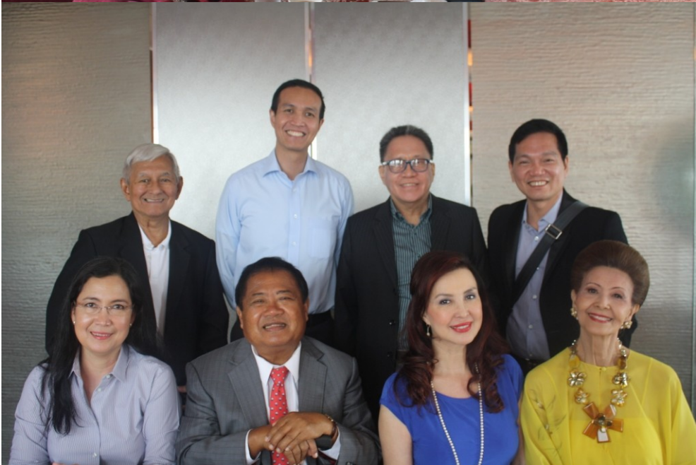
Officers and Members of the Board of Trustees