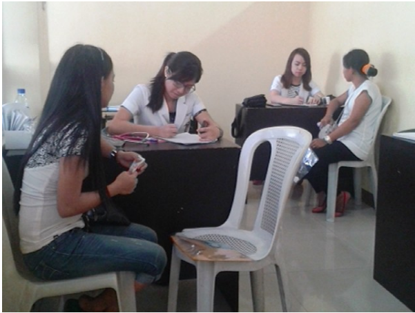
During consultation by patients