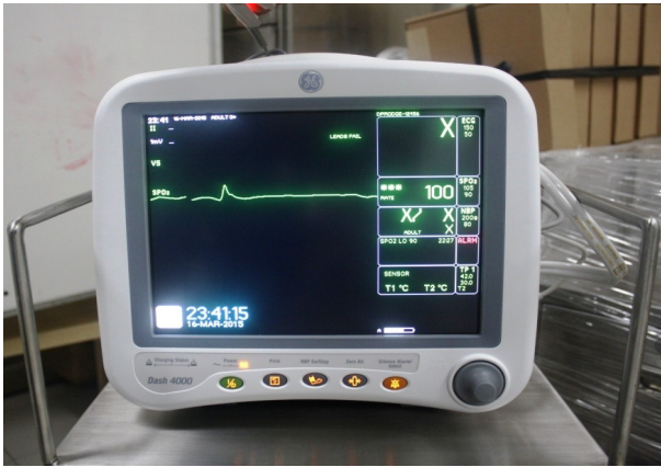
Cardiac Monitors - a device that shows the electrical and pressure waveforms of the cardiovascular system for measurement and treatment. It displays cardiac electrocardiogram (EKG) tracing.