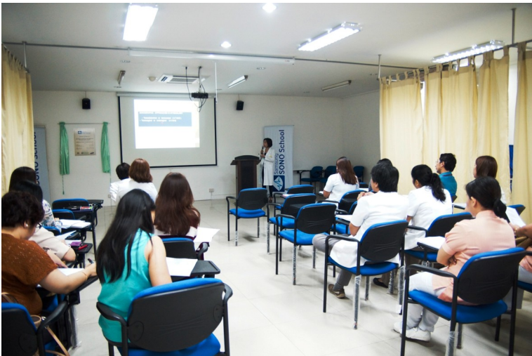
Taken during a training session