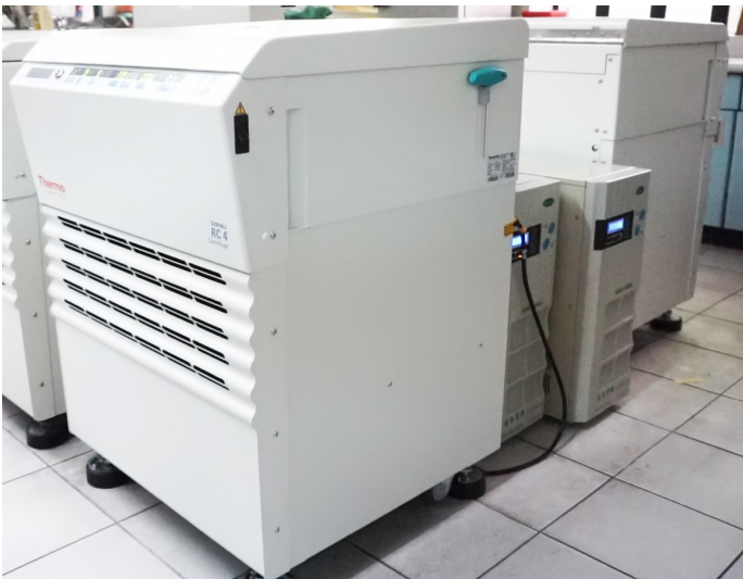
Plasma Freezer - to fractionate / separate the blood components.