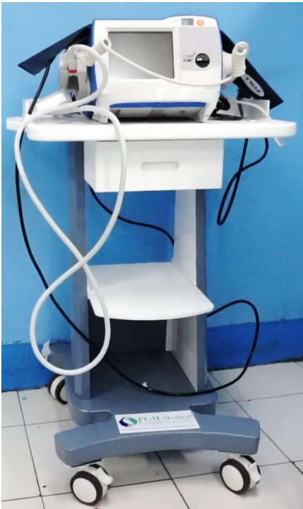
Cardiac Defibrillators - gives electric therapy for advance cardiac life support

Recently, on top of the Php 9M donation, the donors who have now made themselves known, albeit still under the pseudonym- CUBE DONOR UK granted another Php 7M to the Foundation. This has been used to purchase ten (10) units Cardiac Monitors, three (3) units Cardiac Defibrillators for the Department of Emergency Medicine and one (1) Refrigerated Centrifuge for the Blood Bank Section of the Department of Laboratories.