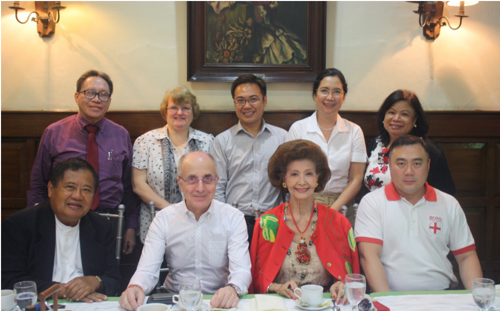
The CUBE Donor- UK (seated 2nd from left front row) and (second from left back row) together with some officers of PGHMF I