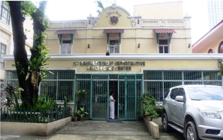
The façade of the Unit