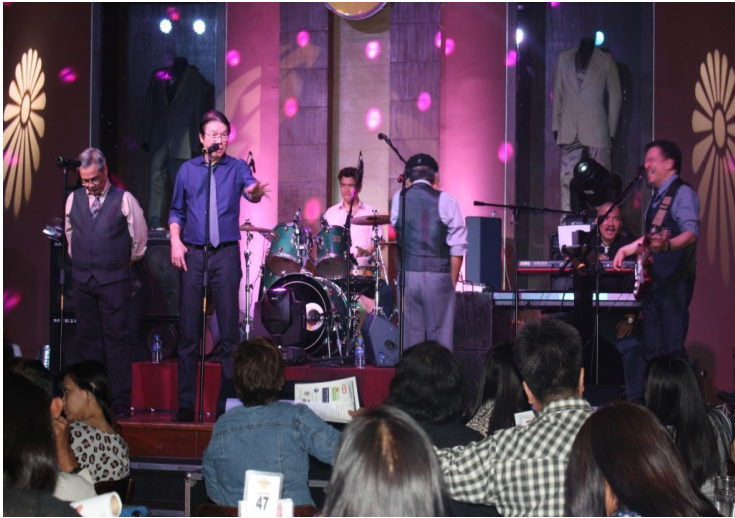
The 70's Superband performing during the event.