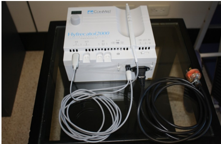
ConMed Hyfrecator Cautery Machine worth Php 95,000.00