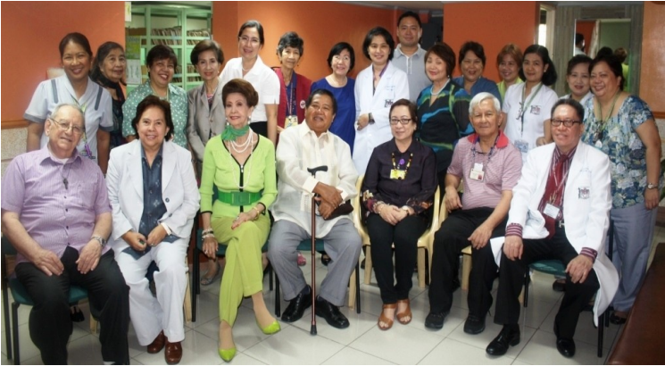
During the blessing of the newly renovated UP Manila– PGH Health Service. Present are the Officers of PGHMF I, PGH Dept. of Family and Community Medicine Officers and Staff and PGH Officials