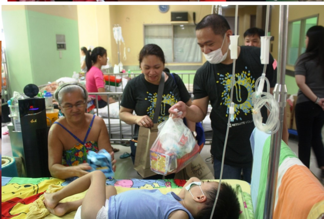
Netsuite Inc. Representative (in black t-shirt) distributes gifts to the PGH Pedia Patients at Ward 9 last Nov. 22, 2014