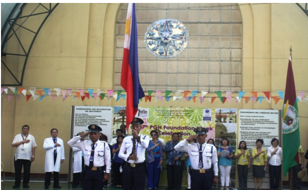
Sharing UP PGH's Vision of Love of Country and Service to Fellowmen, the officers of the PGH Medical Foundation Inc., led the August 18, 2014 Flag Ceremony at the PGH Atrium.

The project "I AM PGH" is no longer a project of the PGH Medical Foundation, Inc.