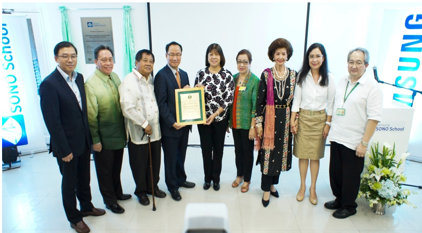
Awarding of Plaque of Appreciation to Samsung Officials