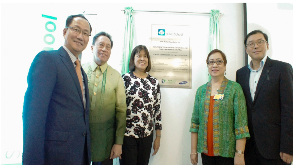
The Unveiling of Samsung Sono School Marker

Cognizant of the high prevalence of maternal and fetal mortality rates in the Asean region, Samsung International, through Samsung Electronics Corporation Ltd. Philippines decided to donate more than Php 18 M to the Philippine General Hospital through the PGH Medical Foundation, Inc. to establish the Samsung Sono School at the Department of Obstetrics and Gynecology. The project will provide the ultrasonic diagnostic training equipment that will be used for the training of medical and paramedical workers, as well as the renovation of the Honoria Acosta-Sison Conference Room of the department which will be the venue for these trainings. The opening and blessing of the School was held last June 24, 2014. The affair was attended by officials of Samsung International, Samsung Philippines, Officers of the PGH Medical Foundation, Inc and PGH Officials.