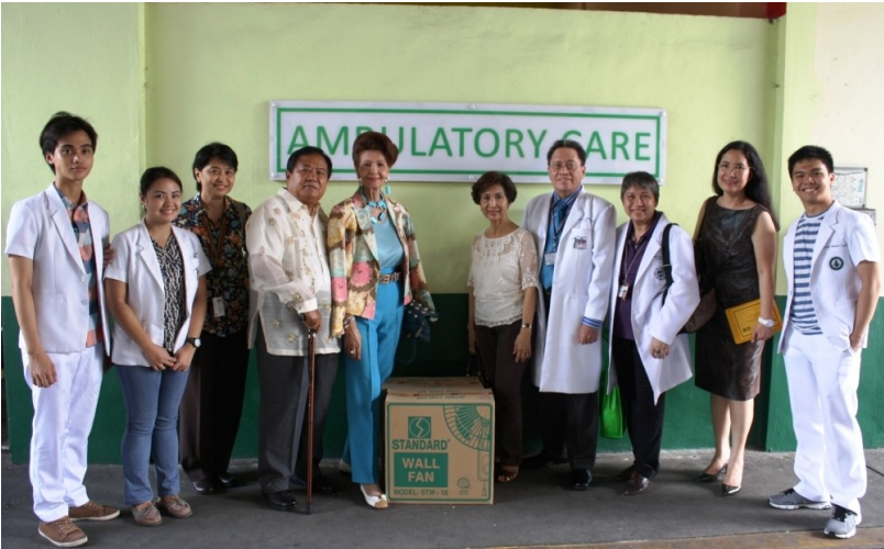
Turnover of various hospital equipment to the PGH Dept. of Family and Community- Ambulatory Care Section.

The Ambulatory Care Section of the Department of Family and Community Medicine was likewise a recipient of various hospital equipment and supplies such as four (4) leather mattresses, one (1) step stool and four (4) electric fans and facility renovation from the PGH Medical Foundation Inc. The official turnover of this project was held last May 29, 2014.