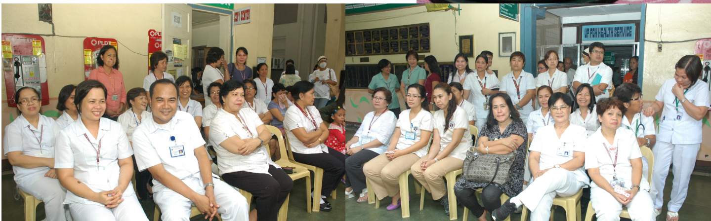
The PGH Community showed support by attending the awarding ceremony