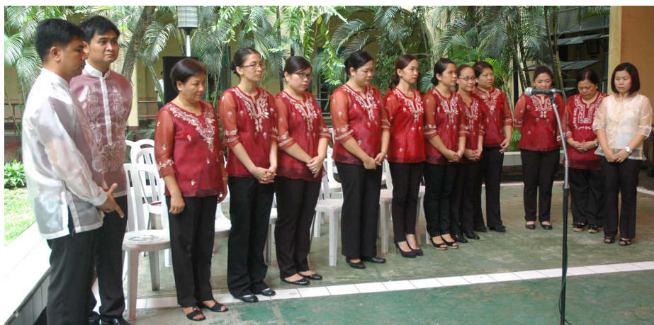
PGH Nurses Association Chorale sung the Philippine National Anthem, PGH Hymn and UP Naming Mahal