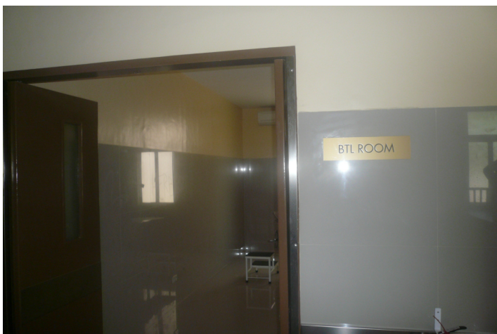
Bilateral Tubal Ligation Room