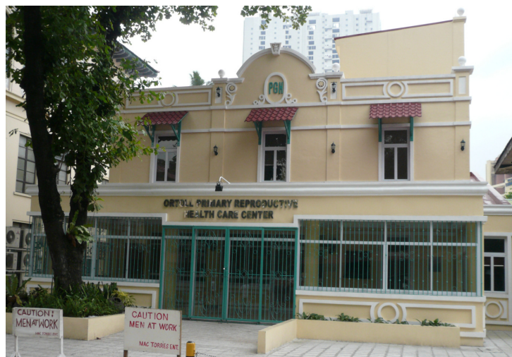
Ortoll Primary Reproductive Health Care Center Building located at PGH Compound Taft Avenue, Manila