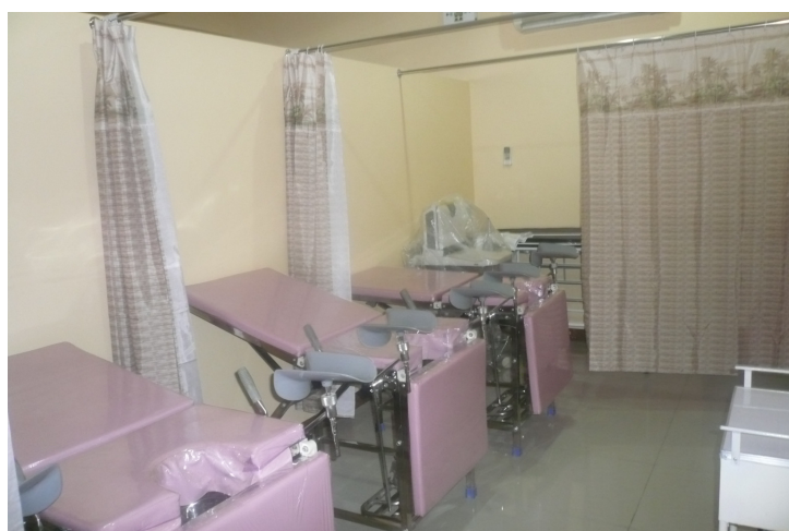
Examination and Ultrasound Section