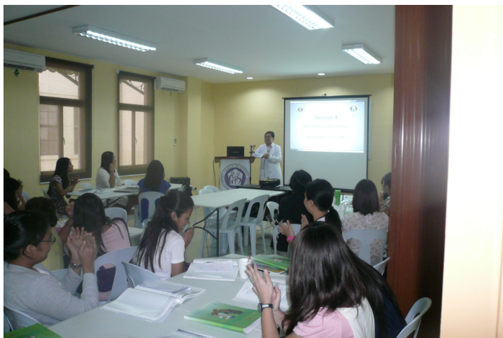
José Maria M. Mutuc Hall—Conference Room