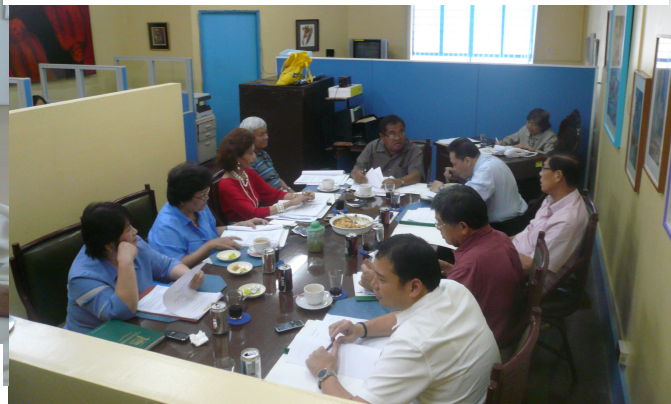
Executive Committee Meeting last August 20, 2010