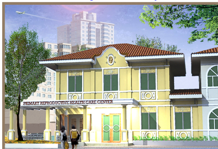
Perspective design of the Primary Reproductive Health Care Center

The objectives of the Center are: 1) to decongest the OB Admitting Section of normal deliveries to enable the Department to attend to more complicated cases; 2) it will provide more cases/materials for training of residents, interns, and paramedical students of the UPCM-PGH and other affiliated medical institutions; 3) the provision of reproductive health services, i.e. family planning clinic and counseling; to ultimately reduce the incidence of maternal morbidity and mortality in the hospital.