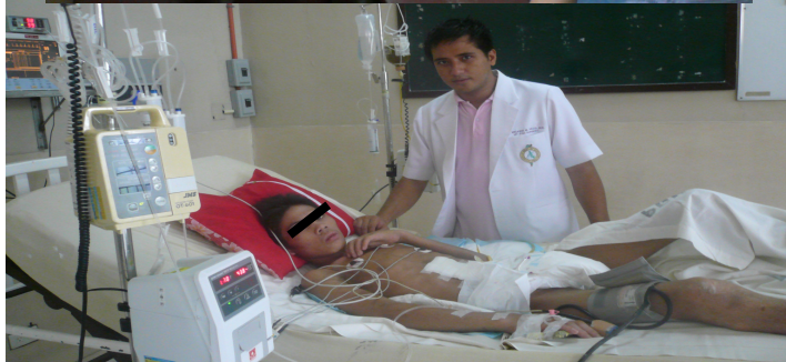
PGHMF I beneficiary with the Resident Doctor at PGH-SICU