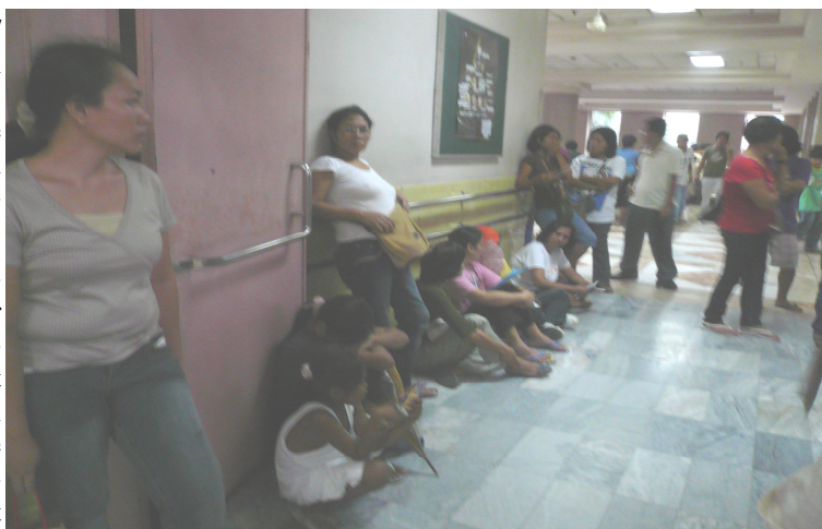
DOPS Patients waiting to be served

Particularly, patients will no longer have to squat on corridor floors and sweat it out in humid and stuffy atmosphere as industrial fans and benches will be placed in the